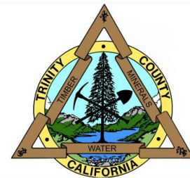
Projected Revenues from Federal, State, and Local Sources for Trinity County